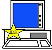
Figure-1. Computer System

The arrows represent the monitoring functionality of the IDS as opposed to the implementation of the computer network.