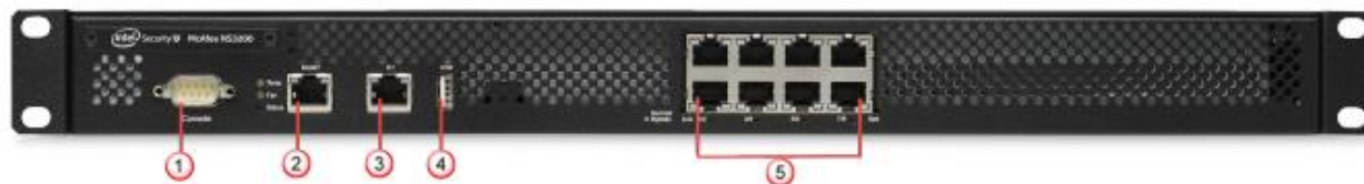
Table 2 –NS3100/NS3200 Front Panel Ports and Connectors