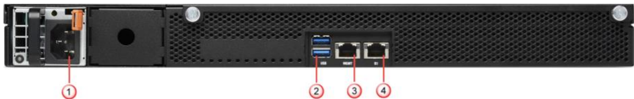
Table 5 – NS5100/NS5200 Rear Panel Ports and Connectors