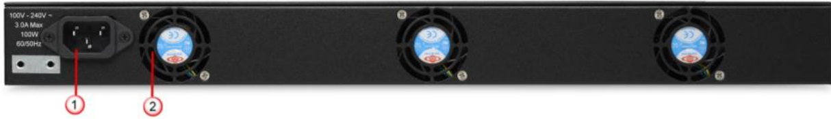
Table 3 –NS3100/NS3200 Rear Panel Ports and Connectors