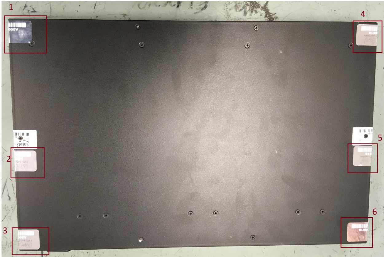
Figure 7 – Tamper Label Placement (NS3100/NS3200 Sensors)

Figure 8 depicts the tamper label locations on the cryptographic module for the NS5100/NS5200 platforms. There are 5 tamper labels and they are numbered in red. An example tamper label is shown in Figure 9.