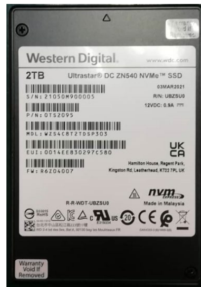
Figure 2 Ultrastar DC ZN540