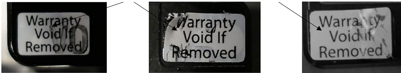
Figure 5: Tamper Evidence on Tamper Seal