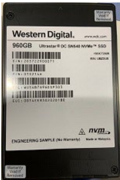
Figure 1 Ultrastar DC SN540

The primary function of the module is to provide encrypted data storage, authenticated access control, and cryptographic erasure of the data stored on the solid-state media. The Cryptographic Module operator, interfaces with the CM through a host system application.