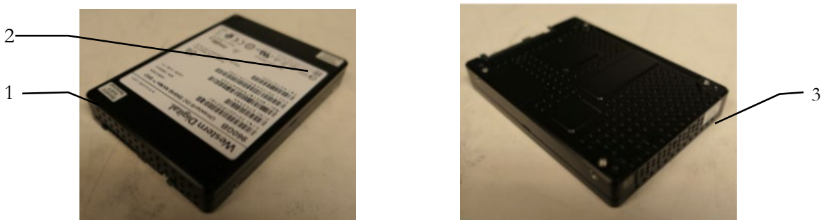
Figure 4: Tamper-Evident Seal Locations

The tamper-evident security seal cannot be penetrated or removed and reapplied without evidence of tampering. In addition, it is difficult to replicate the of tamper-evident security seal.