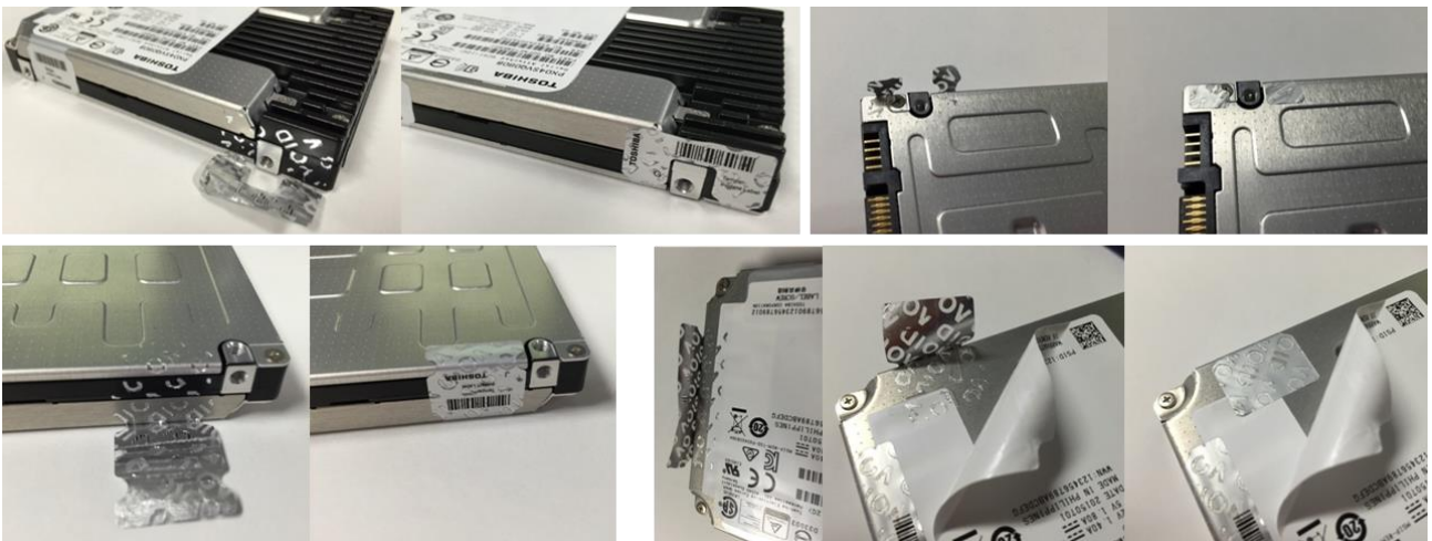
Mark of alphabetic character(s) which constitute a word “VOID”