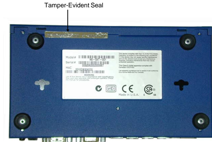
Figure 2 Tamper-Evident Seal