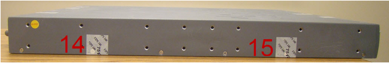
Figure 7 Required TELs for the Aruba 7200 Mobility Controller – Left Side