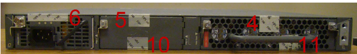
Figure 5 Required TELs for the Aruba 7200 Mobility Controller – Rear