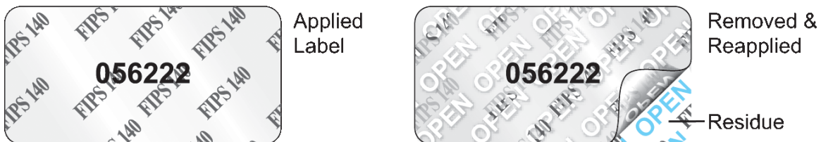
Figure 2 Tamper-Evident Labels

Each TEL also has a unique serial number to prevent replacement with similar labels.