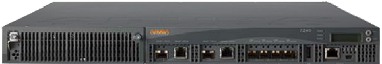
Figure 1 - The Aruba 7200 controller chassis

Figure 1 shows the front of the Aruba 7200 Controller, and illustrates the following: