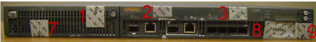
Figure 4 Required TELs for the Aruba 7200 Mobility Controller – Front