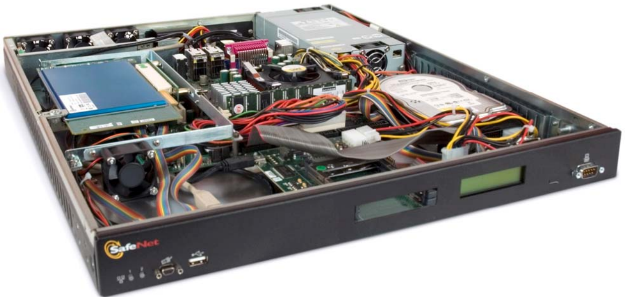
Figure 2-2. Luna Module Installed Inside Luna SA