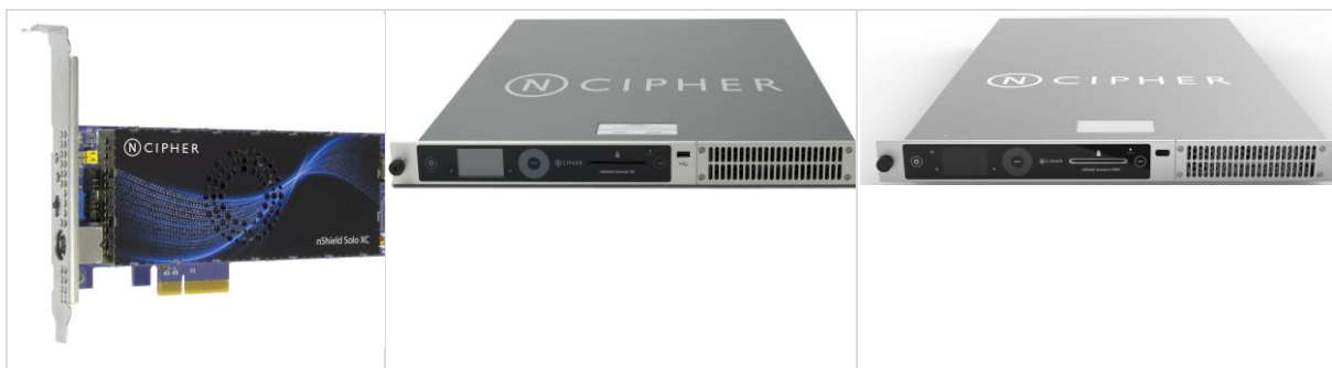
Table 3 nShield Solo XC (left), nShield Connect XC (centre), and nShield HSMi (right)

The table below shows the nShield Solo XC HSM, the nShield Connect XC and the nShield HSM i appliances.