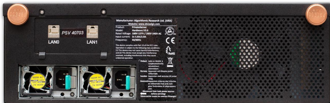
Figure 1 – Tamper Evident cans

The Tamper Evident cans are shown in Figure 1.