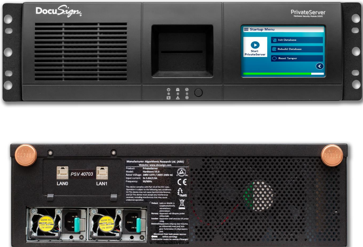
Figure 2 – Front and Rear Interfaces

For FIPS 140-2 purposes, both network ports are treated the same. Through the network ports either an encrypted and RSA based authenticated sessions (Two-way TLS 1.2, using TLS_RSA_WITH_AES_256_CBC_SHA256), or a user ID/password authenticated sessions are permitted over either port when operating in a FIPS 140-2 compliant manner. In a non-FIPS 140-2 compliant manner, the module could be configured so that traffic over the trusted Ethernet port was plaintext while traffic over the non-trusted network was encrypted and authenticated or user-ID/password authenticated.