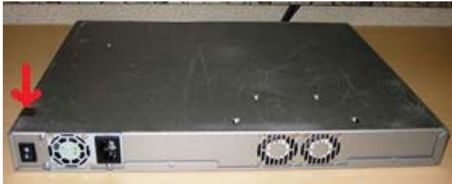
Figure 3 – NSA 2400 Underside/Rear

The chassis is sealed with one tamper-evident seal, which is applied during manufacturing. The physical security of the module is intact if there is no evidence of tampering with the seal. The location of the tamper-evident seal is indicated by the red arrows in Figures 1 and 3 below: