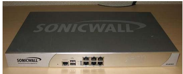
Figure 4 – NSA 2400 Top/Front