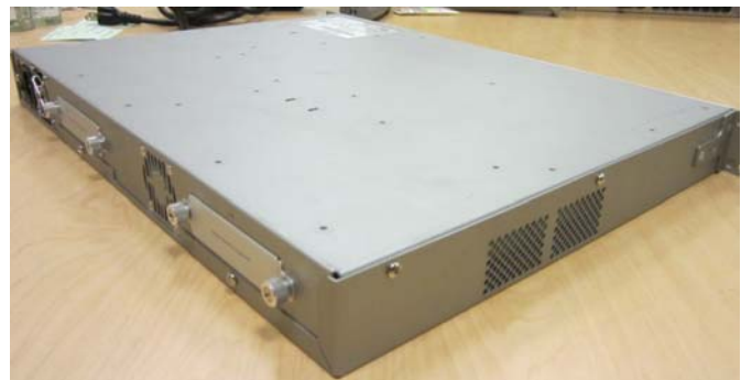
Figure 6 - NSA 2400MX Underside/Rear/Right

The tamper evident seal is applied by Dell SonicWALL during the manufacturing process. The Cryptographic Officer should inspect the module to ensure that the tamper evident seal has been applied on the bottom of the module, as shown above. The Cryptographic Officer must physically inspect the module for signs of tamper every six months. If the module shows any evidence of tamper, the Cryptographic Officer should contact Dell SonicWALL.