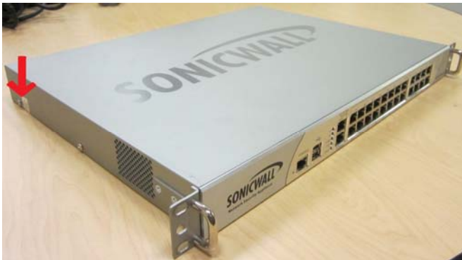
Figure 5 - NSA 2400MX Top/Front/Left