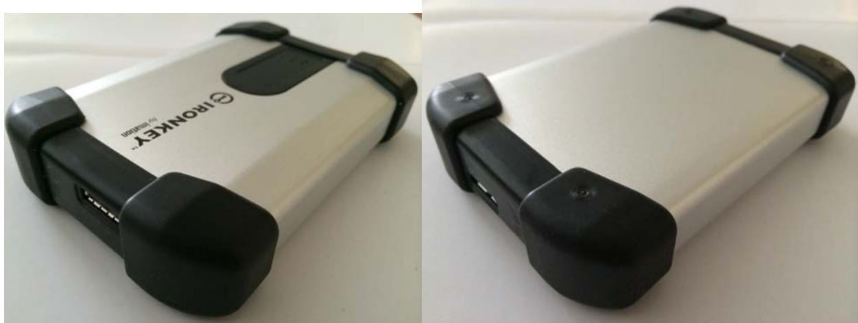
Figures 1 & 2 – Images of the Cryptographic Module w/ Excluded Case

The cryptographic boundary is defined as being the outer perimeter of the metallic enclosure and is depicted below.