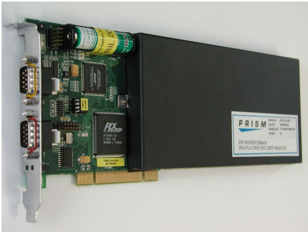
Figure 1. Incognito TSM410 on its PCI carrier card

Figure 1 is a photographic image of the Incognito TSM410. A block diagram of the module indicating the functional components, cryptographic boundary and physical interfaces is presented in Figure 2 (on page 8).