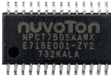
Figure 3. LAG019 in TSSOP28 Package

The physical cryptographic boundary of the Module is the outer boundary of the chip packaging.