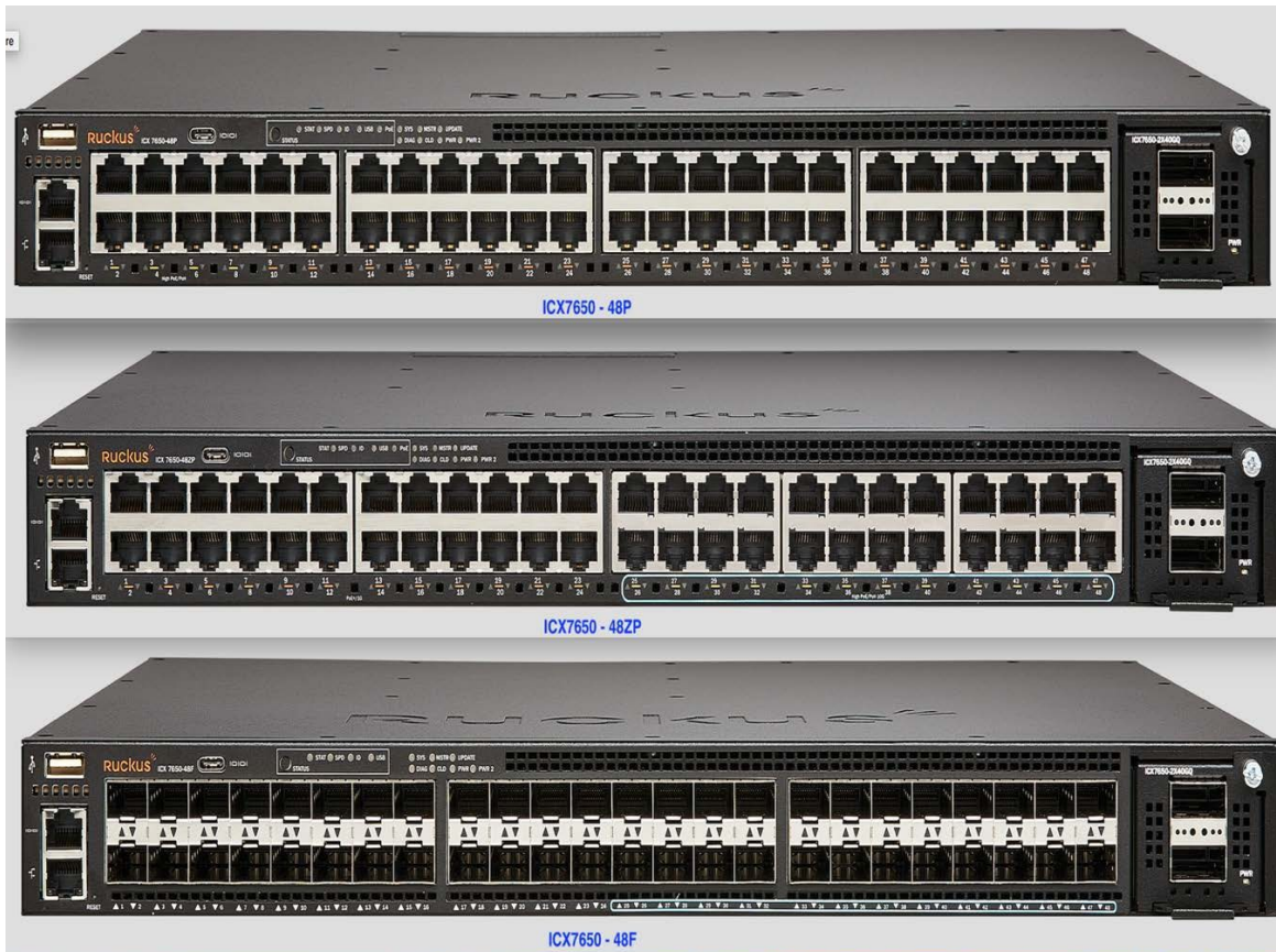
Figure 2 - ICX 7650

Figure 2 illustrates the ICX7650-48P, ICX7650-48ZP and ICX7650-48F.