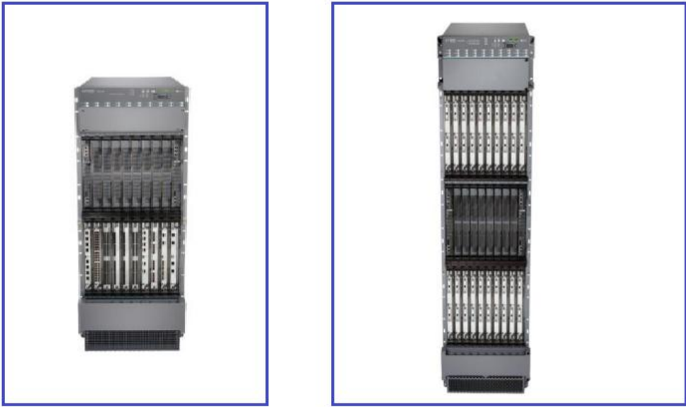
Figure 1: (Left to right) MX2010 and MX2020