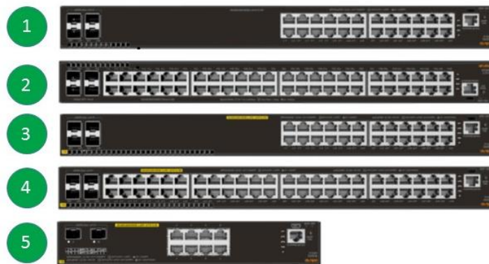
TABLE 3 - 2930F SWITCH SERIES