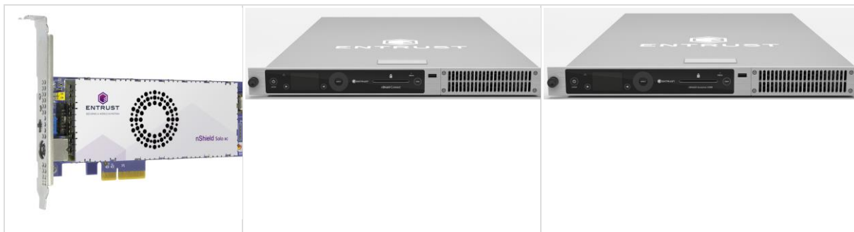
Table 3 nShield Solo XC (left), nShield Connect XC (centre), and nShield HSM i (right)

The table below shows the nShield Solo XC HSM, the nShield Connect XC and the nShield HSM i appliances.