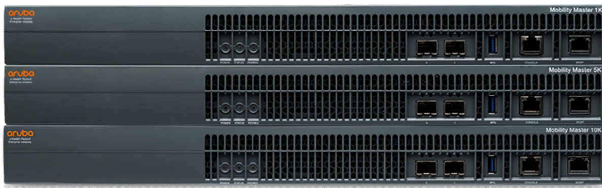
Figure 1 shows the front of the three Mobility Master Appliances (1K, 5K, 10K variants), and illustrates the following: