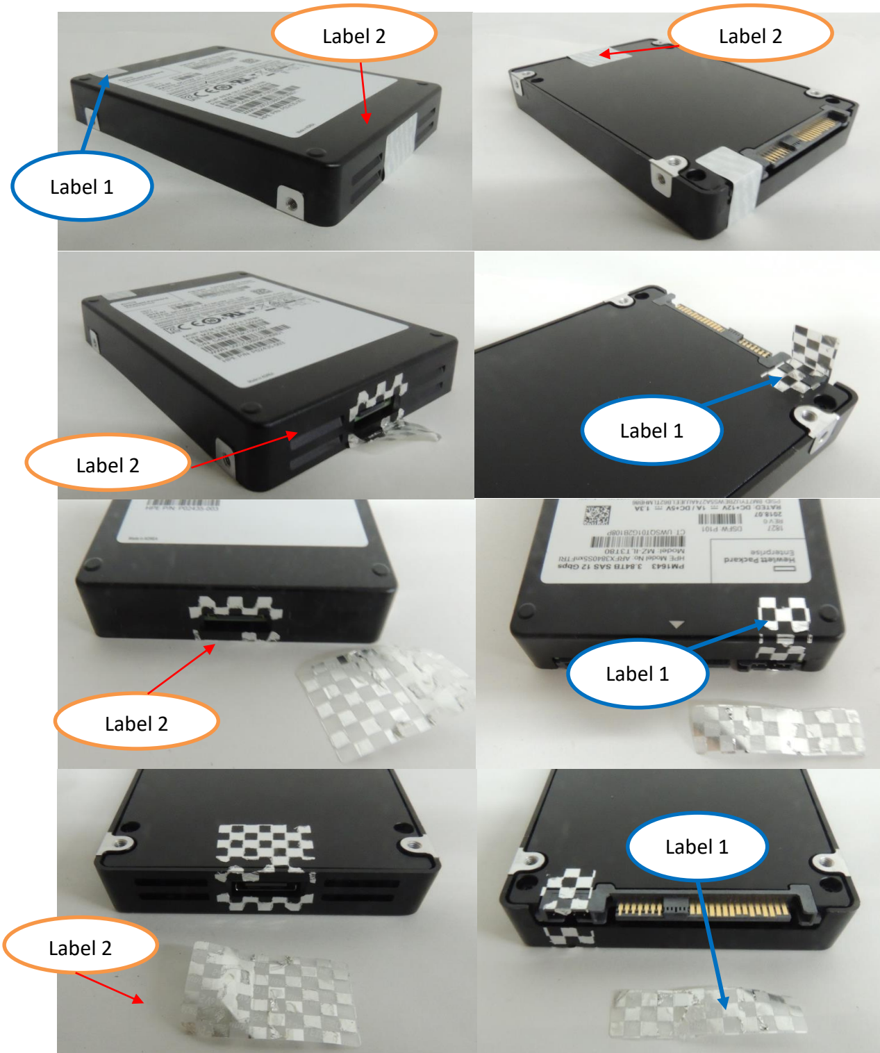
Exhibit 15 - Signs of Tamper