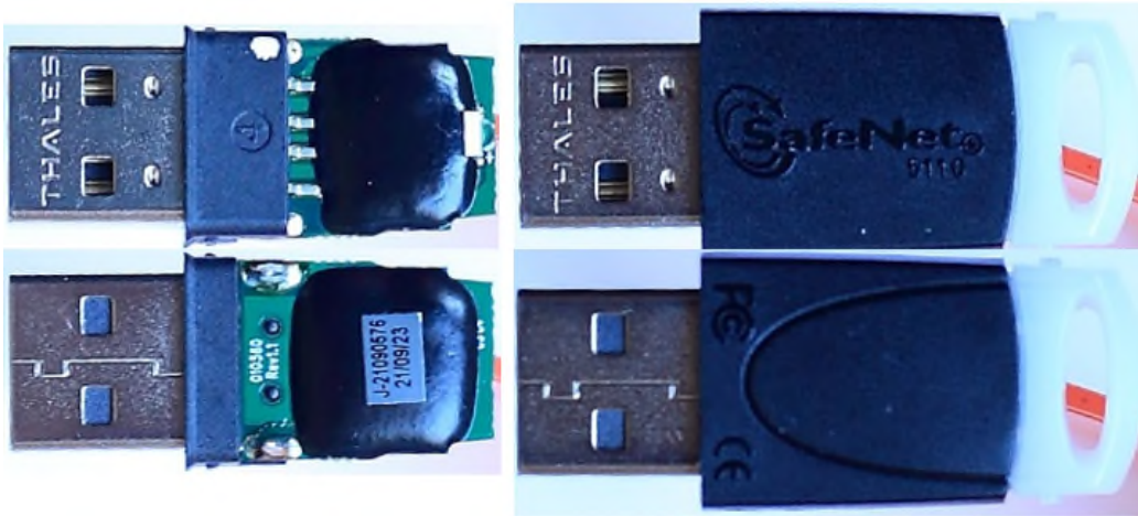
Figure 1 – 'eToken 5110+ FIPS' Crypto Boundary

Figure 1 depicts the Module at the cryptographic boundary.