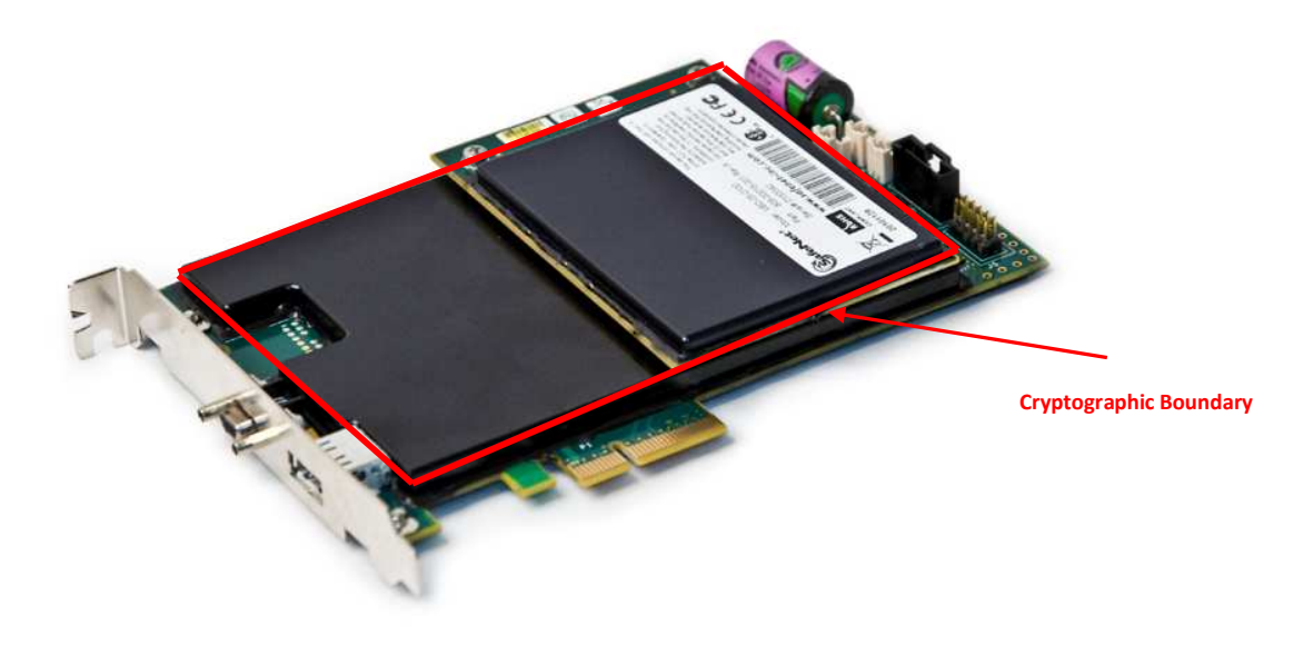
Figure 2-1. Luna PCI-E Cryptographic Module