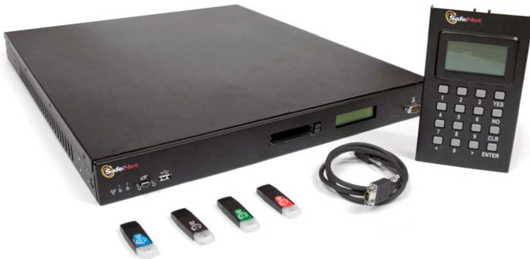
Figure 2-2. Luna SA with PED and iKeys