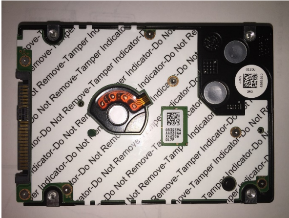
Figure 4: Large Tamper-Evident Label Hardware Version (3)