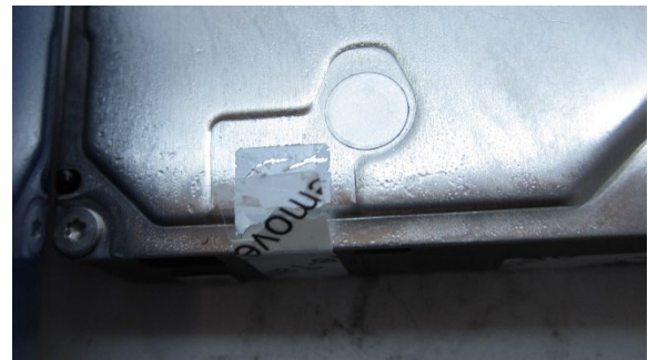
Figure 7: Tamper Evidence on Metal Surface