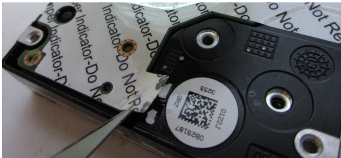
Figure 6: Tamper Evidence on Large Tamper Label

The Cryptographic Officer and/or User shall inspect the Cryptographic Module enclosure for evidence of tampering a minimum of once a year. If the inspection reveals evidence of tampering, the Cryptographic Officer should return the module to HGST, a Western Digital company.