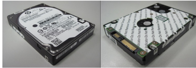
Hardware Version (2)

HGST Ultrastar C10K1800 TCG Enterprise HDDs, hereafter referred to as “Ultrastar C10K1800” or “the Cryptographic Module” are multi-chip embedded modules that comply with FIPS 140-2 Level 2 security. They also comply with the Trusted Computing Group (TCG) SSC: Enterprise Specification . The drive enclosure is the cryptographic boundary (see Figure 1). All components within this boundary are tested against the FIPS 140-2 requirements except for the Actuator Assembly. This part has been excluded from the boundary since it is not security relevant.