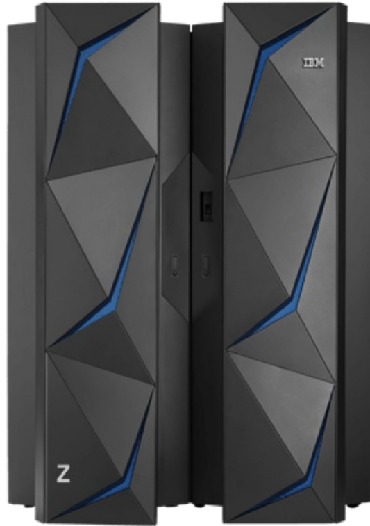
Figure 2: IBM z Systems z14 Mainframe Computer.