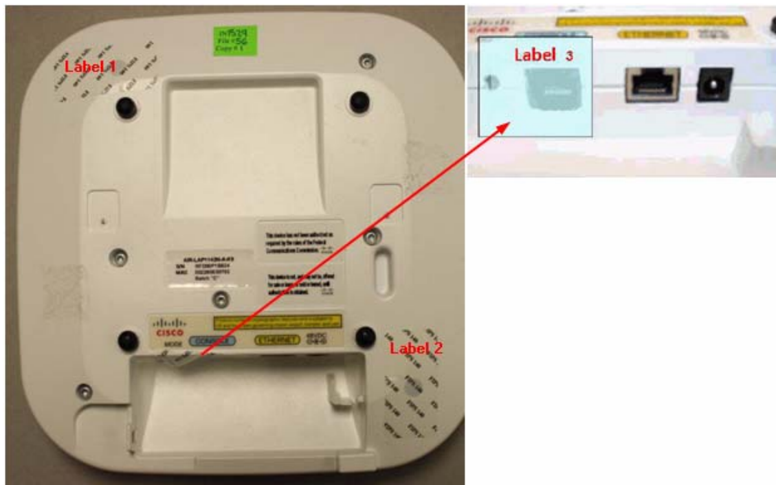
Figure 2 Tamper labels on AP1142

For the AP1142, put tamper evident labels over the specified two (2) screws, over the cap of the mode button, and over the console port as shown in Figure 2 below: