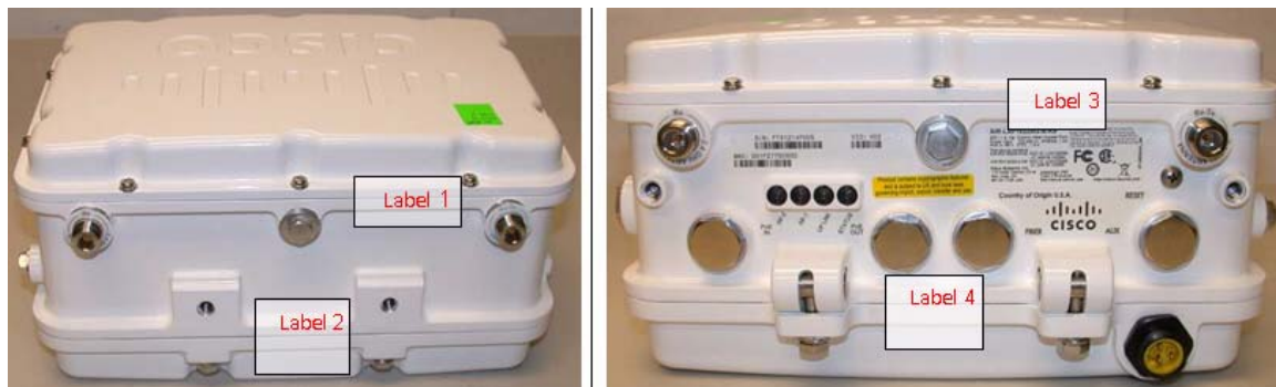
Figure 5 Tamper labels on AP1522

For the AP1522, (FIPS kit AIRLAP-FIPSKIT=, version B0) put two (2) tamper evident labels over the removable top and bottom cover on the left side, and two (2) tamper evident labels over the removable top and bottom cover on the right side, as shown in Figure 5 below: