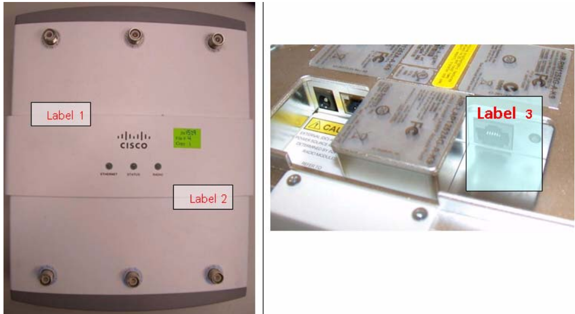
Figure 4 Tamper labels on AP1252

For the AP1252 (FIPS kit AIRLAP-FIPSKIT=, version B0), place quantity two (2) tamper evident labels over the removable top cover, and one (1) over the cap of the mode button and console port as shown in Figure 4 below: