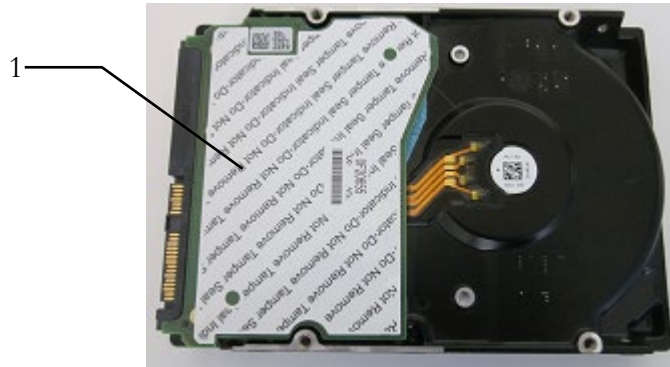
Figure 5: Tamper Evident Seal