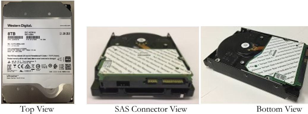
Figure 4: Ultrastar DC HC510 Cryptographic Boundary, Hardware Version 2