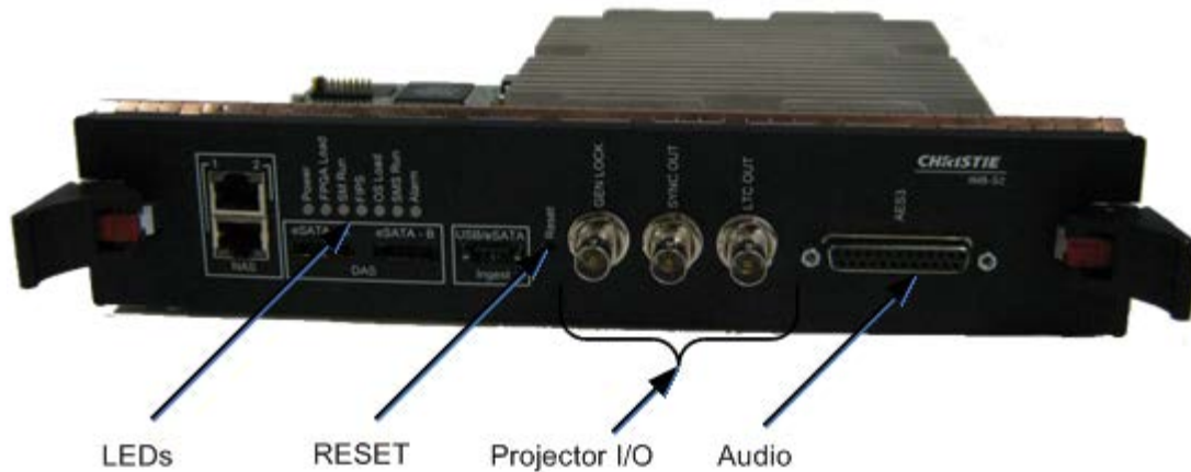
Figure 1 Front view of Christie IMB-S2

The illustrations below indicate the cryptographic boundary and the physical ports defined on the boundary. Unlabelled connectors are not interfaces on the cryptographic boundary.