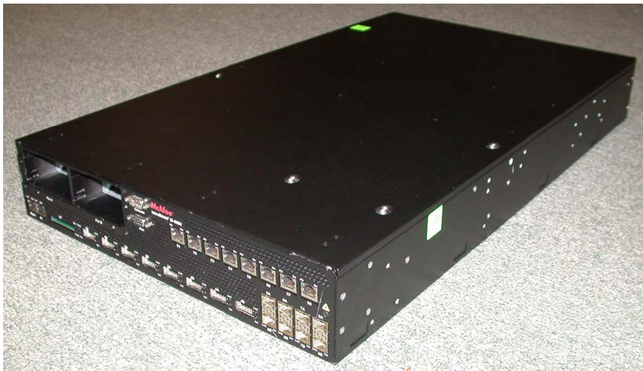
Figure 1 – Image of the Cryptographic Module

Figure 1 shows the module and its cryptographic boundary.