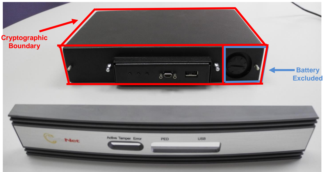
Figure 2-2. Thales Luna USB Cryptographic Boundary (with front bezel removed)