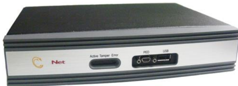
Figure 2-1. Thales Luna USB Hardware Security Module

This Security Policy is specifically written for the Thales Luna USB HSM in a Password Authentication (FIPS Level 2) configuration.