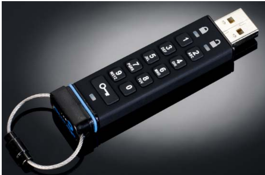
Figure 1 – iStorage datAshur cryptographic boundary showing input buttons and status LEDs