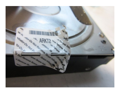
Figure 5: Tamper Evidence on Metal Surface

If signs of tamper are detected, the module should be returned to HGST, Inc.