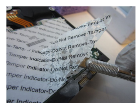
Figure 4: Tamper Evidence on Large Tamper Label

The Cryptographic Officer and/or User shall inspect the Cryptographic Module enclosure for evidence of tampering a minimum of once a year.