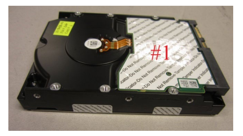
Figure 2: Large Tamper-Evident Label