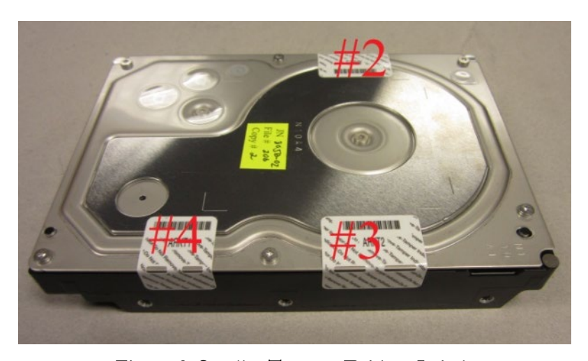
Figure 3: Smaller Tamper-Evident Labels