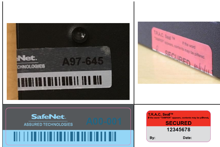
Table 3-9. TEL-SAFENETAT and TEL-TRAC Tamper Evident Labels

Tamper evident labels are applied to the module during the manufacturing process. The Security Officer should perform a visual inspection of the tamper evident labels for evidence of tamper.