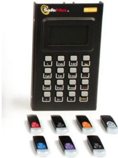
Figure 3-1. Luna PED and iKeys