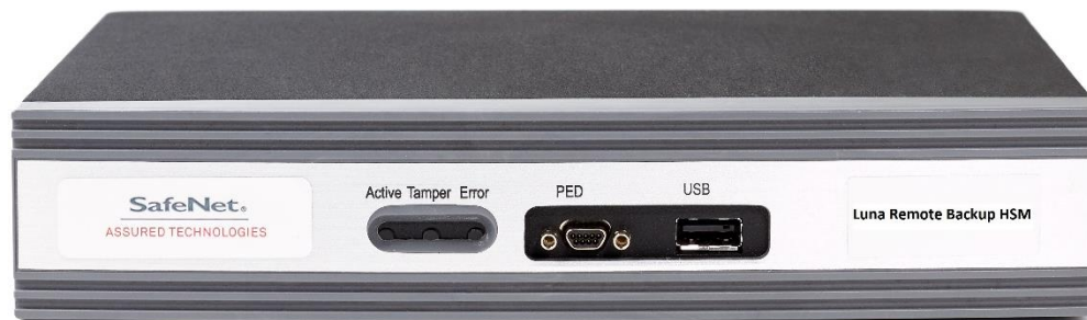
Figure 2-1. Luna Backup HSM Cryptographic Module (with front bezel attached)

This Security Policy is specifically written for the Luna Backup HSM cryptographic module in a Trusted Path Authentication (FIPS Level 3) configuration.