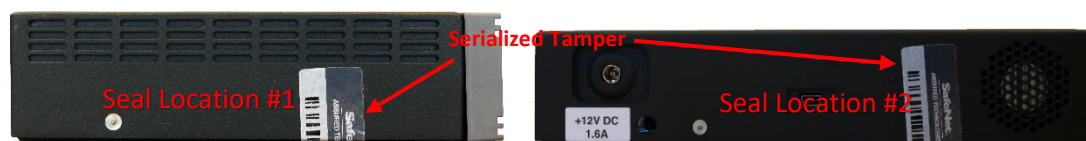
Figure 3-1. Tamper Evident Label Locations

There are two tamper evident labels used on the module's enclosure: one covering a screw on the left side of the enclosure and one covering a screw on the rear side of the enclosure.