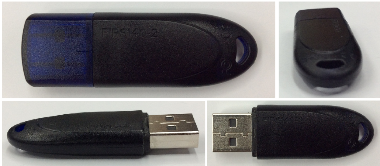
Figure 1. WatchKey ProX USB Token-4 angles

The physical boundary of the WatchKey ProX USB Token cryptographic module is defined as the opaque enclosure surrounding the token device as shown in the picture below.