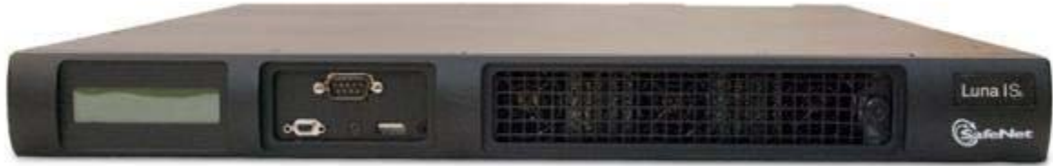
Figure 2-2. Luna IS with PCI-E Installed