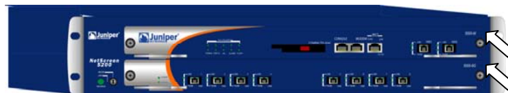
Location of Tamper Evident Seals