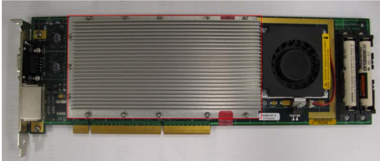
Figure 1: Front side of Atalla Cryptographic Subsystem.

Below is a photographic picture of the Atalla Cryptographic Subsystem. The red line around the outer metallic enclosure represents the cryptographic boundary.