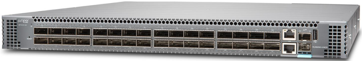
Figure 5 - QFX 5120-32C front view