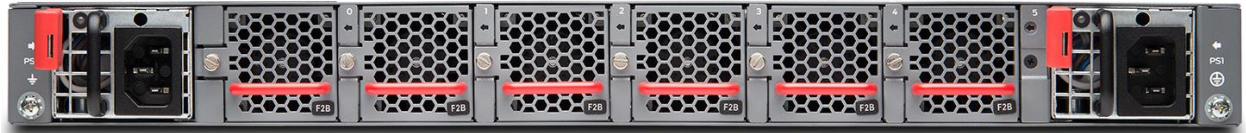
Figure 6 - QFX 5120-32C rear view