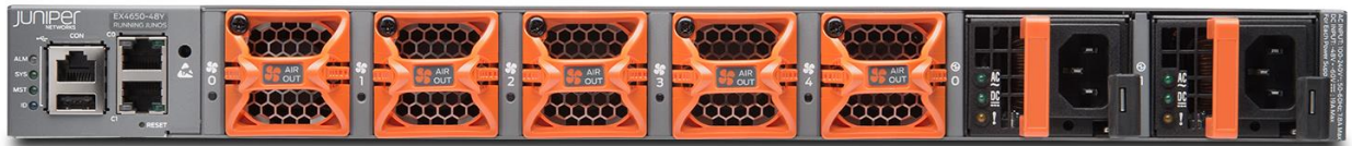
Figure 10 - EX4650-48Y rear view

The following table maps each logical interface type defined in the FIPS 140-2 standard to one or more physical interfaces.