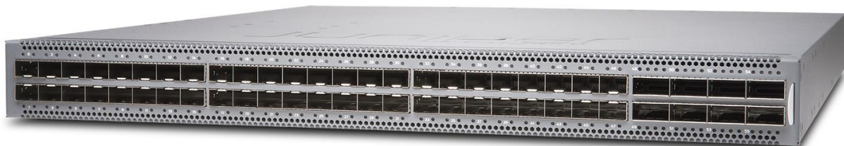
Figure 3 - QFX 5120-48Y front view