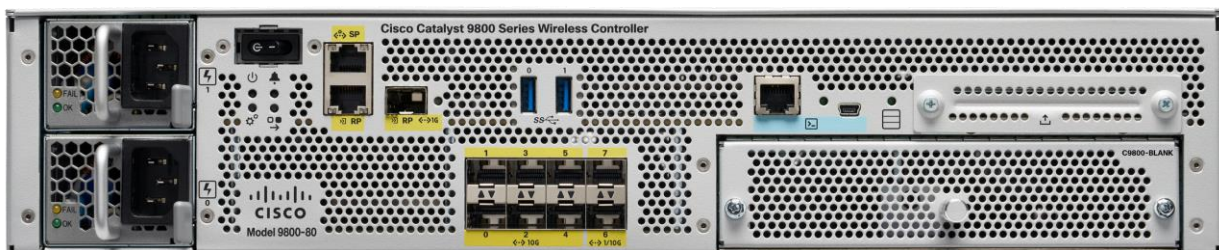
Figure 3: Front Cisco Catalyst 9800-80