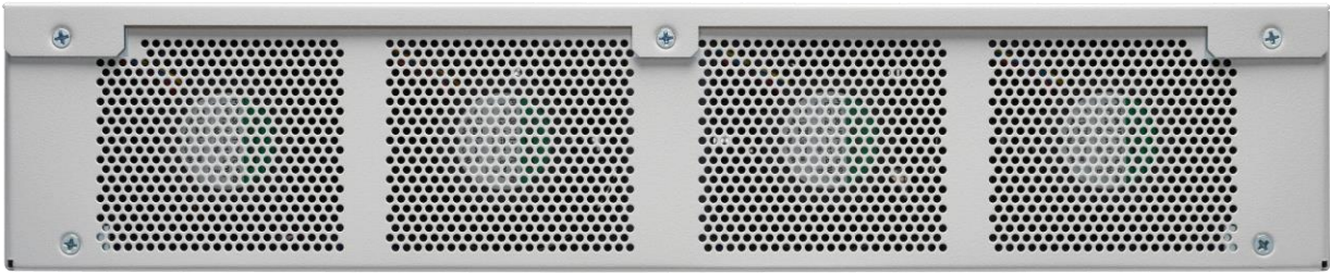
Figure 4: Rear Cisco Catalyst 9800-80