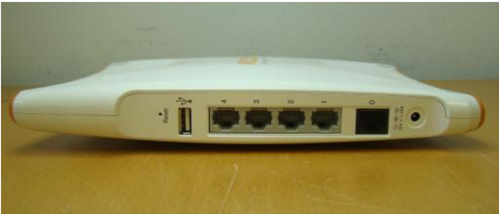
Figure 3: Back view of Aruba RAP-5WN