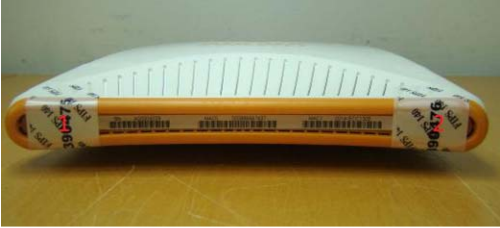
Figure 4: Left side view of Aruba RAP-5WN