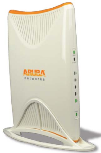
Figure 1 - RAP-5WN Wireless Access Point

The RAP-5WN is a powerful platform for the multi-user small branch office or for power users who work from a home office. The RAP-5WN is a high-performance indoor Remote Access Point platform with multiple access and uplink technologies available. The RAP-5WN features wired and wireless connectivity and security, the ability forward traffic based on policy, user centric security, and backup connectivity over cellular networks make this platform ideally suited to the always-on office. The RAP-5WN features wireless LAN capabilities on multiple SSIDs, air monitoring, and wireless intrusion detection and prevention over the 2.4GHz and 5GHz bands (802.11a/b/g and 802.11n). The RAP-5WN provides a USB port for connection to a 3G modem for cellular backup of the WAN link. The Remote Access Point works in conjunction with Aruba's Multi-Service Controllers to deliver high-speed, secure network services to your remote locations.