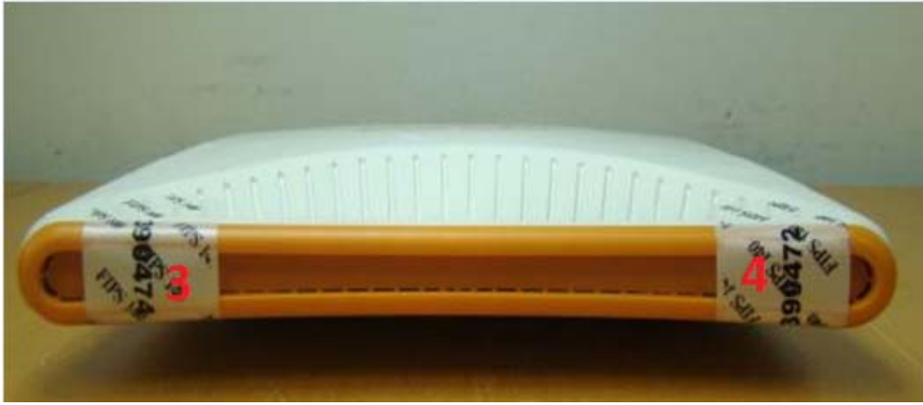
Figure 5: Right side view of Aruba RAP-5WN