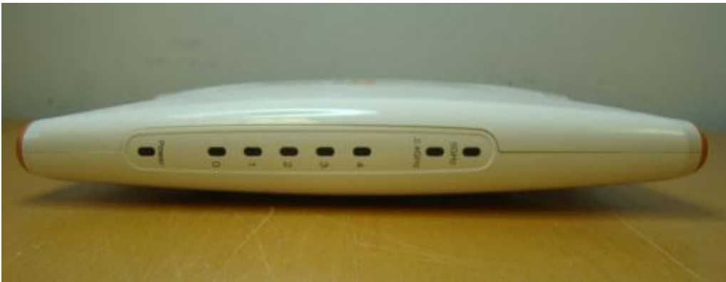
Figure 2: Front view of Aruba RAP-5WN

The tamper-evident labels shall be installed for the module to operate in a FIPS approved mode of operation.