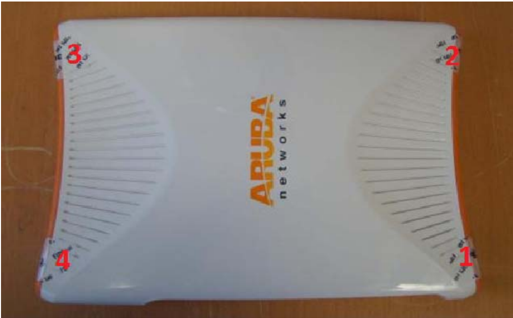
Figure 6: Top view of Aruba RAP-5WN