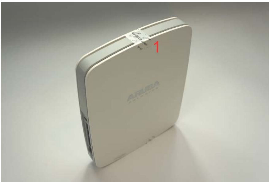
Figure 1 - RAP-155/155P Top View

Following is the TEL placement for the RAP-155/155P: