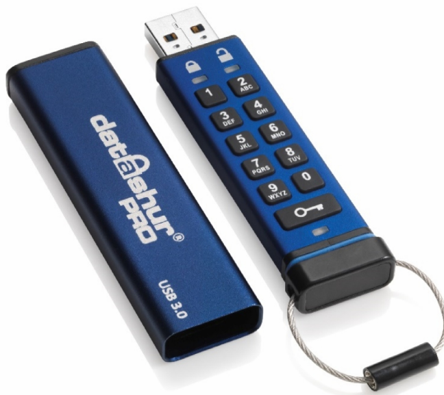
Figure 1: iStorage datAshur Pro 3.0 Cryptographic Boundary Showing Input Buttons and Status LEDs