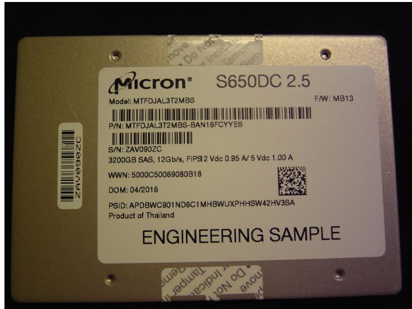
Figure 1: Top view of tamper-evidence label on sides of drive