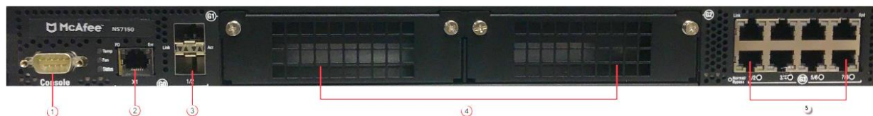
Table 2 –NS7100/NS7200/NS7300 Front Panel Ports and Connectors