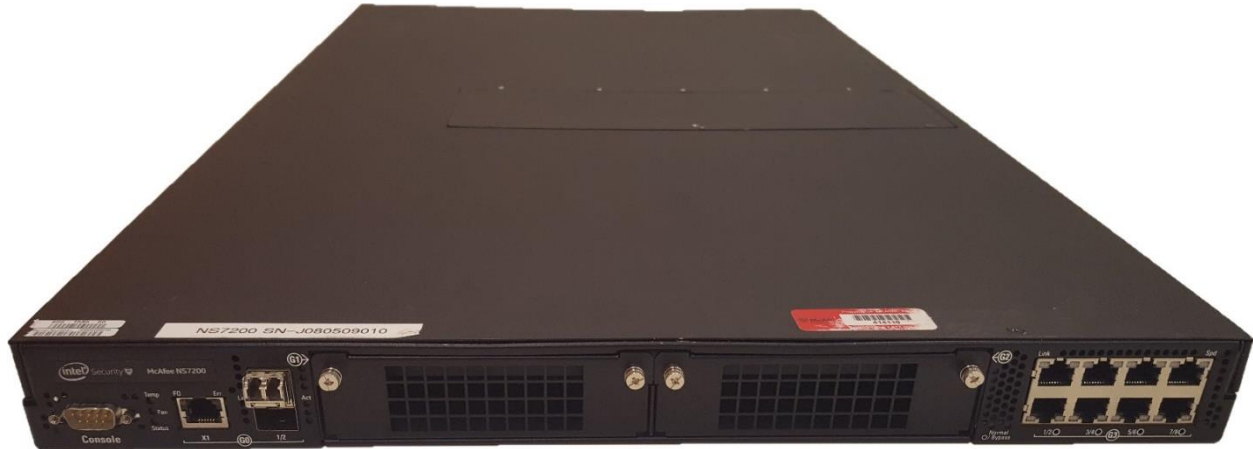
Figure 1 – Image of NS7100/NS7200/NS7300

The cryptographic boundary is the outer perimeter of the enclosure, including the removable power supplies and fan trays. (The power supplies and fan trays are excluded from FIPS 140-2 requirements, as they are not security relevant.) Optional network I/O modules are not included in the module boundary. Figure 1 shows the module configuration and the cryptographic boundary.