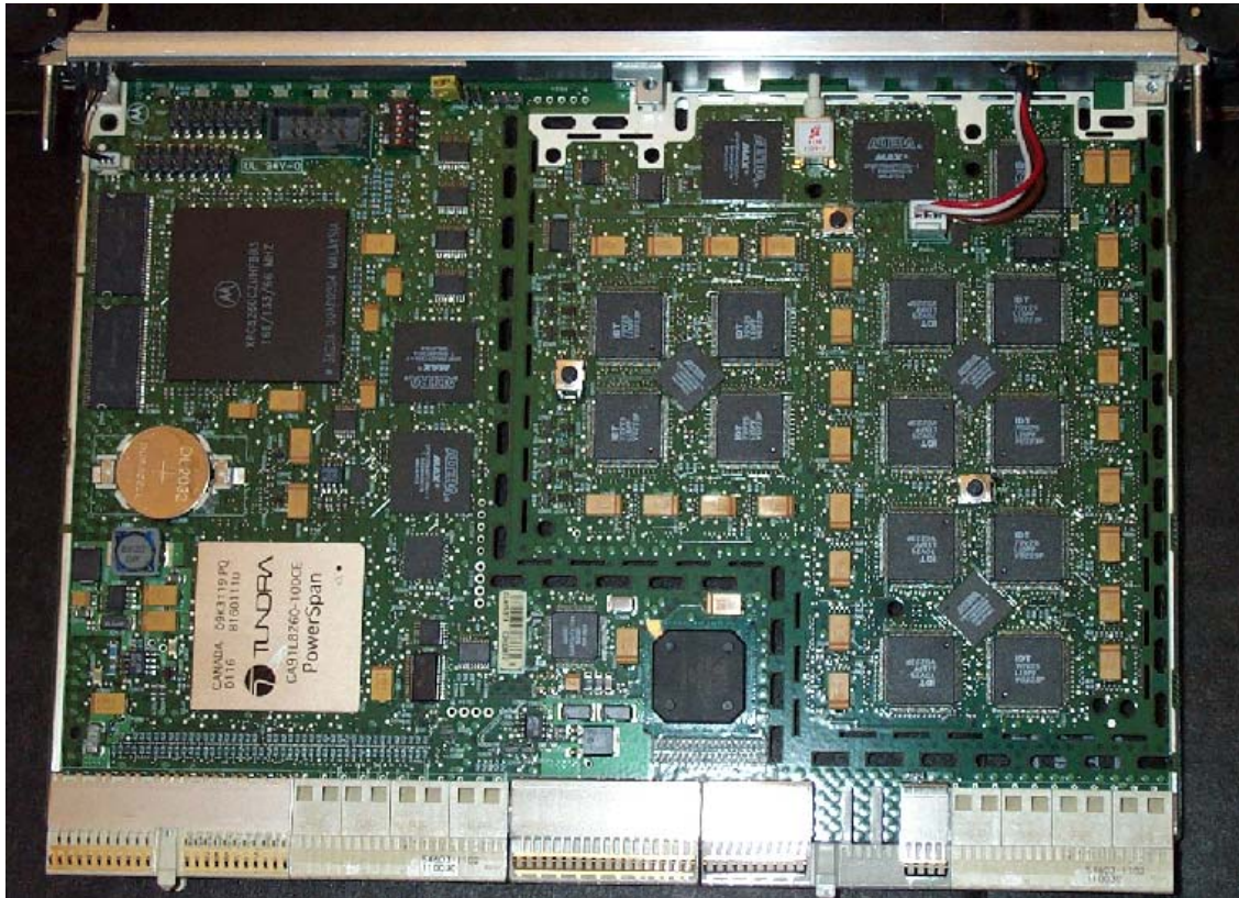
Figure 1: MGE SCCE front w/o tamper shield. Crypto boundary defined by dashed 'line'.