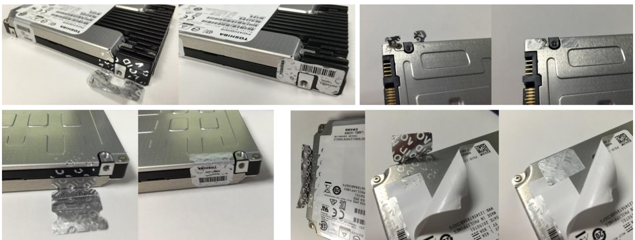
Mark of alphabetic character(s) which constitute a word “VOID”