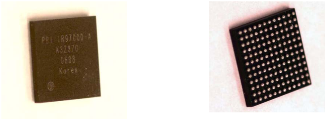
Figure 1 - Cryptographic Module

Digital postal payment systems, such as the Digital Meter Program, rely on secure accounting of postage funds and printing a cryptographic digital postage mark on a mail piece. A PSD provides security services to support the creation of digital postage marks that are securely linked to accounting. A PSD provides two types of data protection: secrecy of critical security parameters (CSPs), such as cryptographic keys, and data integrity protection for funds relevant data items (FRDIs) such as accounting data. CSPs and FRDIs reside in the PSD. The Cygnus X3 PSD cryptographic module is a single chip module. The module's cryptographic boundary is defined as the package of the secure processor, the Sigma ASIC, designed by Pitney Bowes.