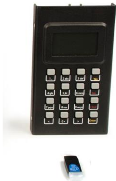
Figure 2: Luna PED and PDA iKey