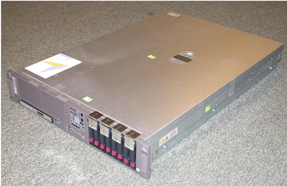
Figure 1 – Image of the Cryptographic Module

The Accellion Secure File Transfer Appliance (HW P/N ACFIPS-01 Version 1.0.0; FW Version FTA_8_0_3, FTA_8_0_136, and FTA_8_0_488) is a multi-chip standalone cryptographic module as defined in the FIPS 140-2 standard. The cryptographic boundary is the external surface of the hard, opaque, commercial grade metal case. The primary purpose for this device is to provide data security for file transfers.