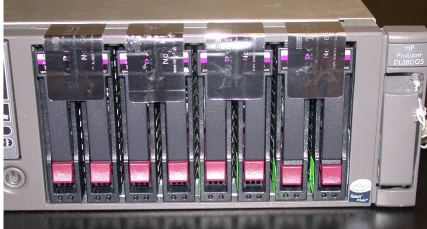
Figure 4: Tamper Seals over Front Hard Drives