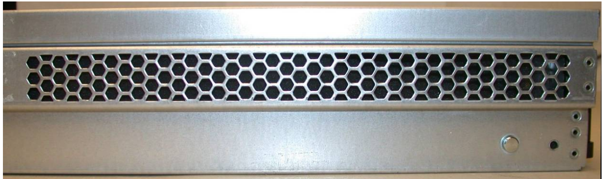
Figure 2: Right Vent Dust Filter Placement