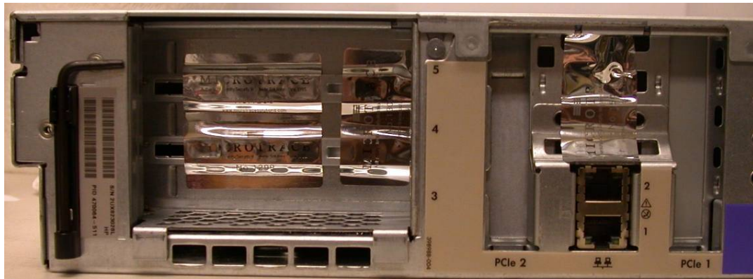
Figure 5: Rear Tamper Seals