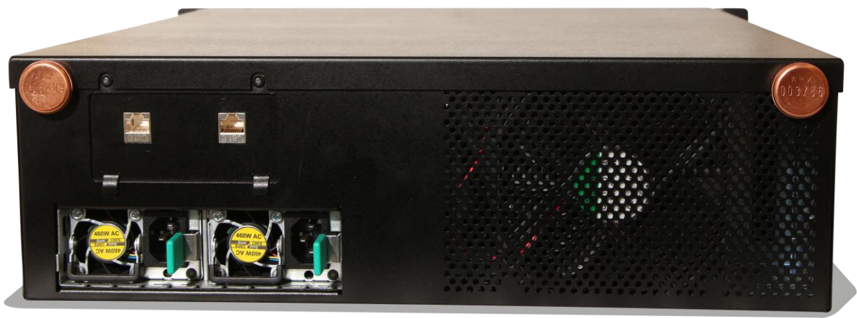
Figure 2 - Tamper Evident cans

The Tamper Evident cans are shown in Figure 2.