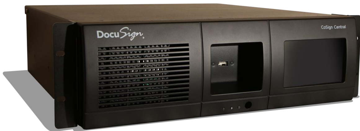
Figure 1 - DocuSign Signature Appliance

Starting for DocuSign Signature Appliance version 9.0.9.10, it is possible to install the Appliance in an HSM style where a user of the Appliance can also have Symmetric encryption/decryption keys such as AES in addition to using RSA keys.