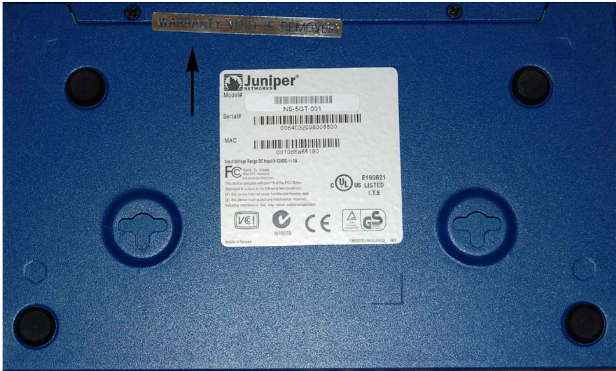
Figure 2: Underside of the NS-5GT, with location of tamper evident seal